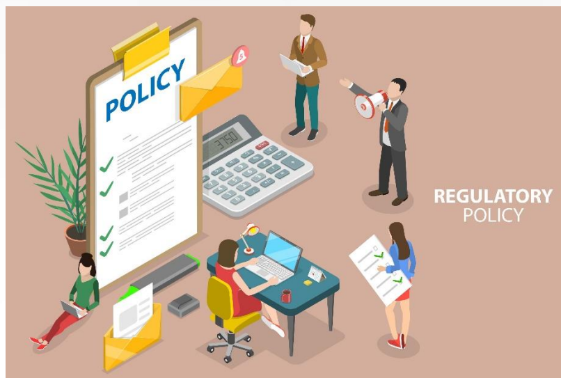
Collaborative advocacy with organisations in adjacent sectors

Similarly, as a member of the Packaging Chain Forum managed by EUROPEN, Afera co-signed a manifesto expressing serious concerns about the European Commission's suggested approach on packaging and packaging waste regulation (PPWR) :