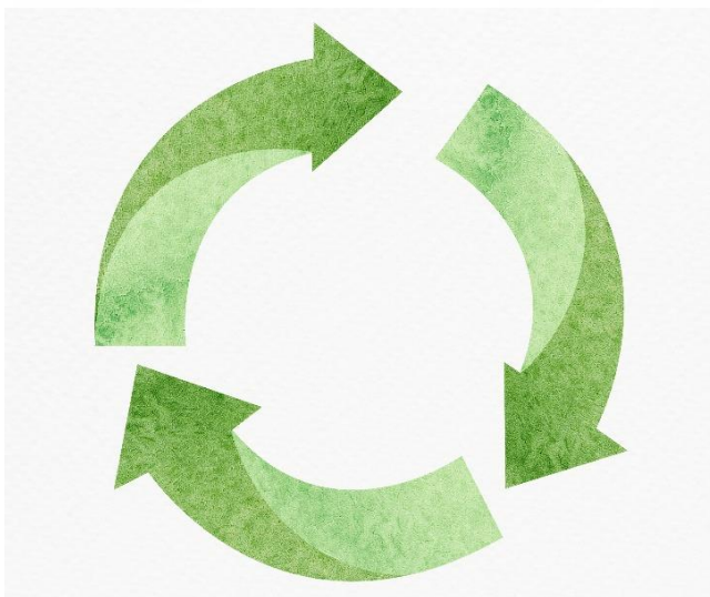
Keeping the liner in the loop

Therefore, cooperating on this common topic of release liner was a natural outcome. CELAB provided a database of release liner waste collectors and recyclers to the waste management workstream of AFSP.